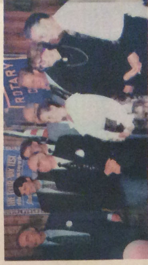
FIRST NATIONAL BANK SPONSORED A LOCAL Summerville-Trion Rotary Club Event At The Tavern